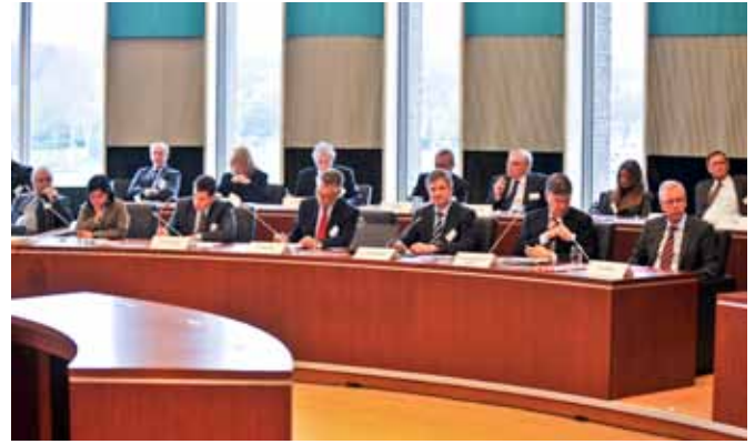
Plenary session in Provincial Government House on Thursday 5 November 2009

Cologne Participatory Budgeting (Germany) is a project involving citizens via the internet in the preparation of the budget of the City. The project created the opportunity for citizens to participate in designing the municipal budget focusing on three areas – playgrounds, streets and sports – by setting up an e-Platform. This initiative determined a lot of discussions, but also proposals, ideas and corrections. In total, 10 231 participants, 4973 proposals, 9184 comments and overall 52 746 assessments were carried out. Through this new method a new culture of participation was created based on transparency and ability to activate huge and different target groups. Currently, and in the context of a wider approach, there are 38 municipalities in Germany which have either introduced a participatory budget or executing participatory budgeting for the second or third time.